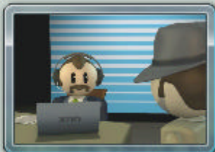
Cartoon Interview between me and Sizer. This is a re-upload. I had it up before.