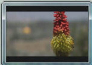
First 15 minutes of the original "With God On Our Side" documentary.