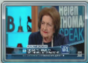
Helen Thomas Interview